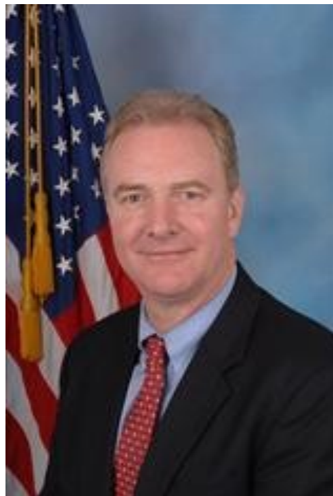
United States Representative Chris Van Hollen (D-MD)

Cloaked under the populist rhetoric of campaign finance "reform" the legislation is proving to be anything but. As Representative Van Hollen has consulted with lobbyists from such diverse groups as Democracy 21 and the National Rifle Association, the legislation has become a series of carve outs for special interests. First and foremost the DISCLOSE Act