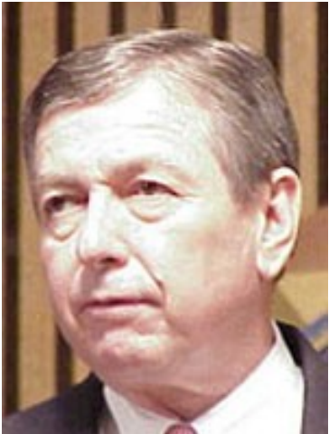
Former Attorney General John Ashcroft was labeled "too conservative" by liberals

Notably, Bush's pick for Attorney General, John Ashcroft, was a nominee singled out by liberals and in the media for being "too conservative." The Ashcroft nomination was held up as an example of just how "out of touch" Bush was with the American people. By contrast, President Obama's more radical appointments are generally passed over by the liberal media, with only the alternative conservative news outlets highlighting them.