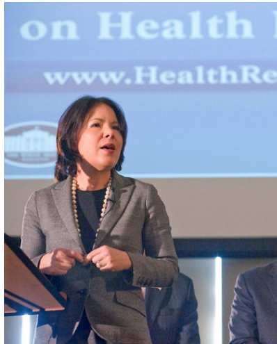
Nancy-Ann DeParle, One of Obama's Many Czars

Case in point is President Obama's practice of appointing "Czars" for almost everything the federal government is attempting to accomplish. Unbelievably, the President has signed up more than thirty czars to date! Some of them include: Afghanistan Czar, AIDS Czar, Border Czar, Car Czar, Climate Czar, Domestic Violence Czar, Drug Czar, Economic Czar, Energy Czar, Green Jobs Czar, Guantanamo Czar, Health Czar, Science Czar, TARP Czar, and Urban Affairs Czar. The bureau-