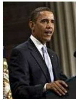
Terrorists Should be Tried by Military Commission

KSM must think he won the lottery, because this decision gives him an advantage. He knows that being sent to a civilian court gives him a fighting chance to beat the U.S. justice system and become a hero to terrorists and extremists once again. Why give this war criminal a trial in the civilian courts? A trial in open court in New York City - in lower Manhattan no less - will become a media circus. You'll have a defense team trying anything and everything to get their client off the hook, with no tactic out of bounds. You'll have press conferences, you'll have impartial jury problems, you'll have leaks, and worst of all, KSM will have a venue to spew his warped ideology. Furthermore, let's not forget about the amount of information that will be released in the course of an open trial. This